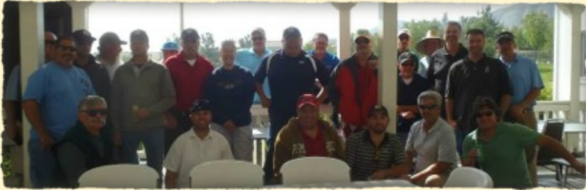
A Great Day had by All.....