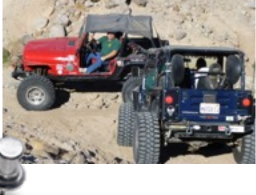
New Year's Bash At Truckhaven